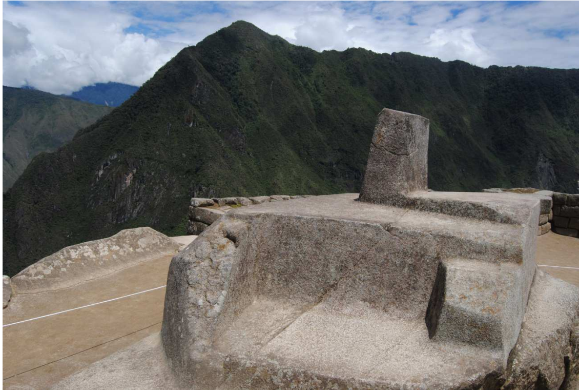
Fig. 5 – The Intihuatana rock on March 9 th 2011, 11:02 am Peruvian time.

to the 75 th western longitude, the sun rock is located at 72°33' western longitude. The difference can be adjusted by means of an astronomical calculating programme, called "Easy Sky". It tells the exact position of the sun when fed with the coordinates. Further sources of error can be deviations with regard to celestial mechanics between 2011 and the time of the erection of Machu Picchu or deviations of the direction of the stone from the geographical north (in which the sun is culminating). Those error sources, however, can be disregarded, as rough calculations show.