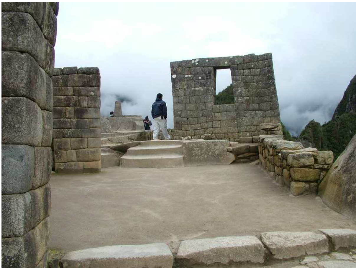
Fig. 3 – View of the Intihuatana stone (background).