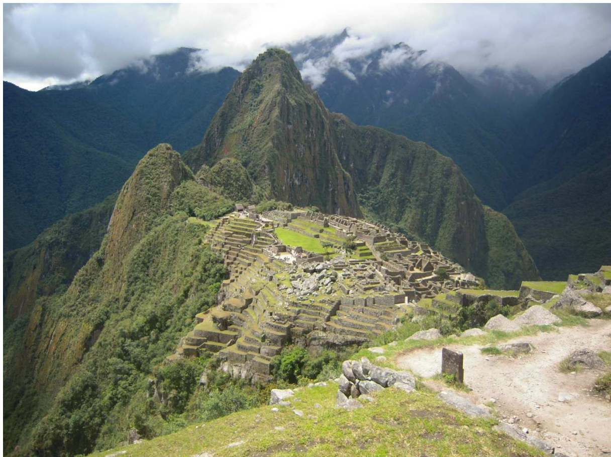
Fig.1 View of Machu Picchu from southwest.

The Intihuatana stone, which is the subject of the following paper, is situated in the ancient Peruvian city Machu Picchu about 2400 meters above sea level (fig. 1). Deep below the Intihuatana stone flows the river Urubamba and not far away Cusco, the old capital of the Incas,