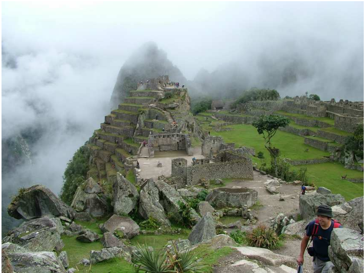
Fig. 2 – View of the „observatory“

Since the discovery of Machu Picchu archeologists, historians, experts in South America Studies as well as ethnologists have undertaken a wealth of attempts to uncover the secret of Machu Picchu, to unravel the function and meaning of this place and deriving conclusions about the culture of the Incas. A number of these studies focus on the Intihuatana stone as the center of a solar observatory (fig. 2).